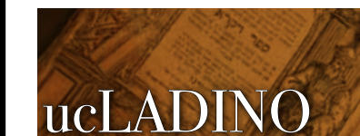
Image: Dissertationes ad scientiam naturalem pertinentes [1772].